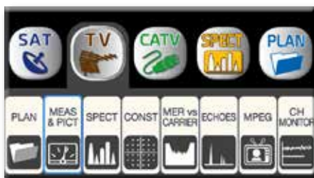
New Icon Navigation Menu